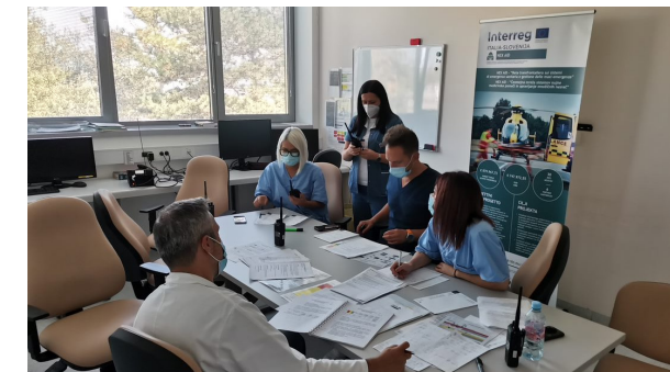
Equipement and protocol testing in the scope of MI exercise